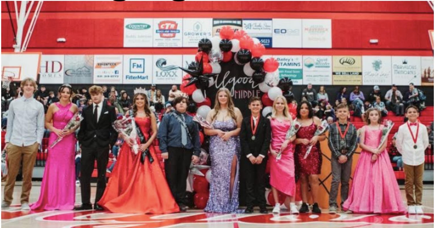
Basketball Homecoming Court 2023